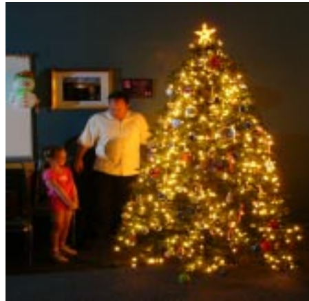
Lighting the Christmas Tree