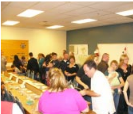
Dublin CHP Family